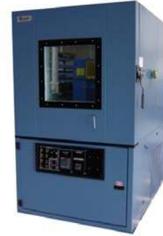
G (B/D) - 32