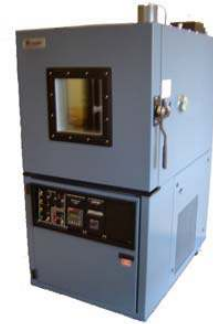
G (B/D) - 8